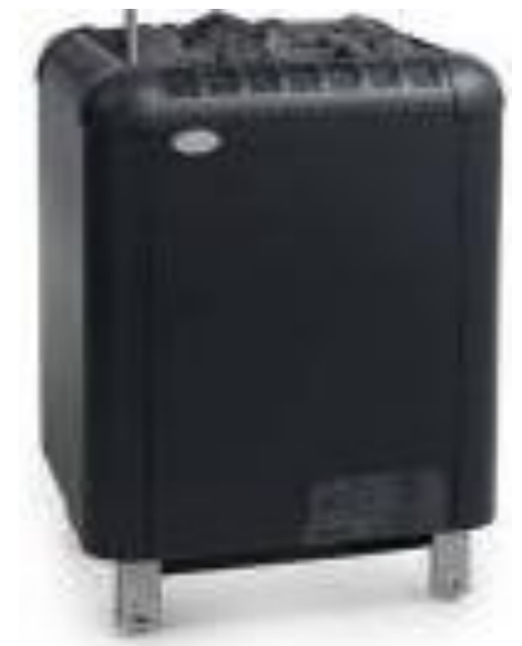
Ferro Heater 9kW – 12kW