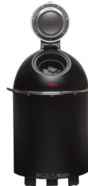
Saunatonnttu Eveready Heater 3kW – 8kW