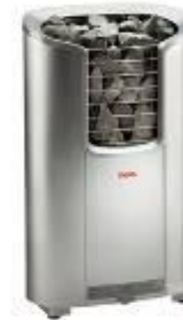
Roxx Heater 6kW – 9kW